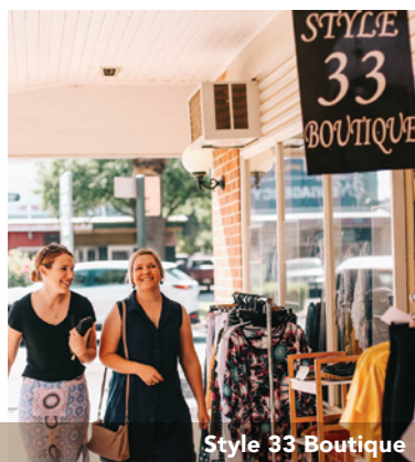
Style 33 Boutique