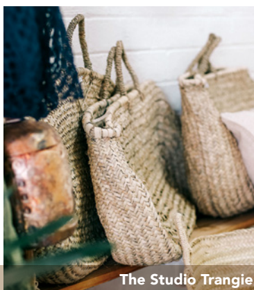
The Studio Trangie