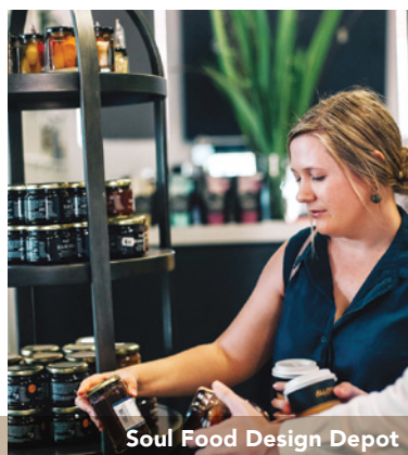
Soul Food Design Depot