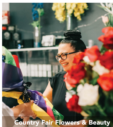
Country Fair Flowers & Beauty