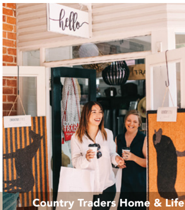
Country Traders Home & Life